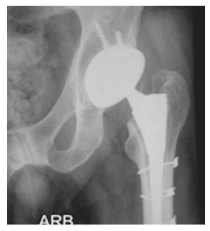
Figure 7: Post-revision X-ray appearance.