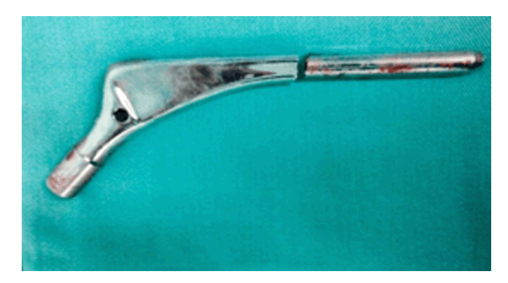
Figure 6: Detail of the fractured implant.